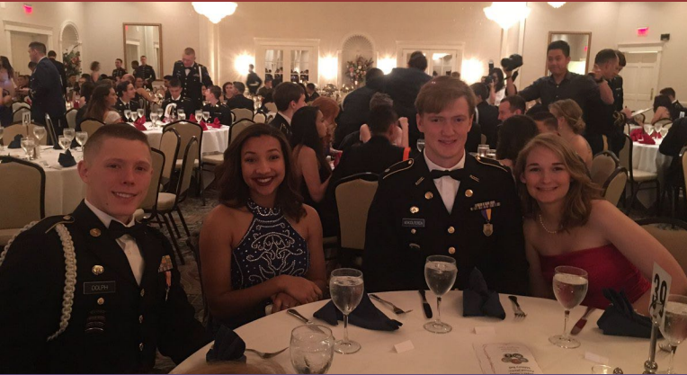
Joint JROTC Military Ball