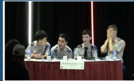
Lake Braddock 220